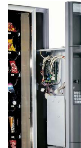
Separate compartment with independent access to the payment systems and electronic board

The payment systems and electronic board are located inside a separate slide-out compartment with independent access allowing operators to work in this area without affecting the temperature inside the product holding compartment. Snakky offers the option of dispensing 0.5 litre PET bottles, placed upside down, without the use of any accessory.