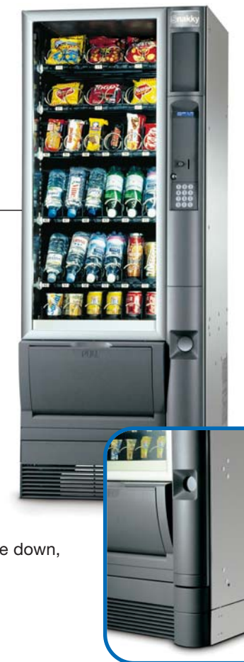
Hot-air outlet from the side panel