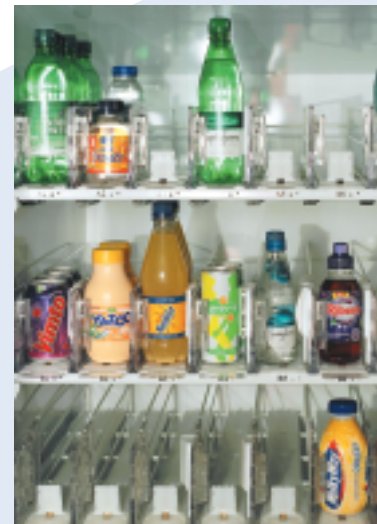
Motorless Vend Mechanism