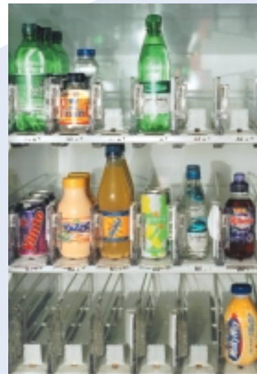
Motorless Vend Mechanism