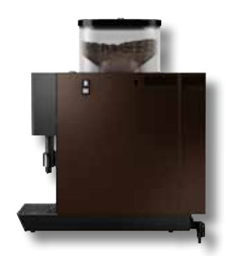
WMF 1200 F side view