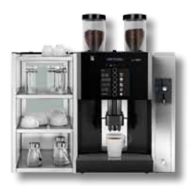
WMF 1200 F with additional equipment

A worldwide service network unique in the industry covering more than 70 countries ensures that you can always rely on your wmf coffee machine.